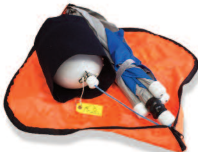
MICROSTAR CARRY CASE BAG LENGTH: 37IN. (94CM) MANUAL DEPLOYMENT AND OPENING