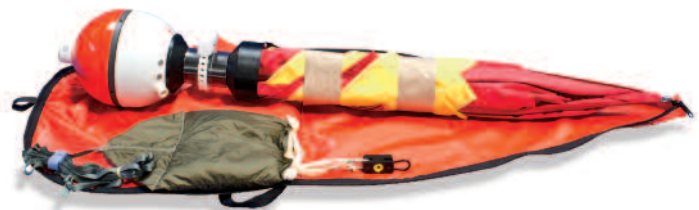
MICROSTAR CARRY CASE W/ PARACHUTE BAG LENGTH: 55IN. (140CM) AUTO OPENING: - AIR DEPLOYMENT (INCL. PARACHUTE) - MANUAL DEPLOYMENT (NO PARACHUTE)